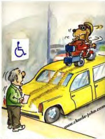
"Hey, you've handicapped my car!"