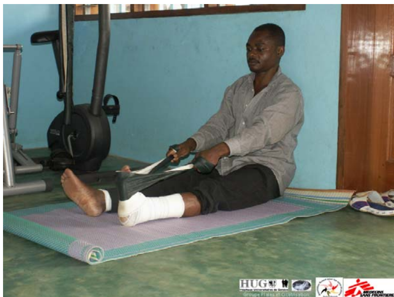
Rehab and wounds in Akonolinga