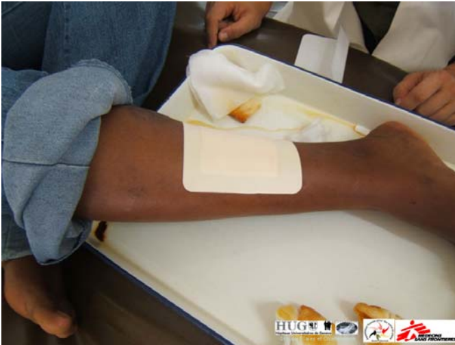
First modern wound dressing in Akonolinga