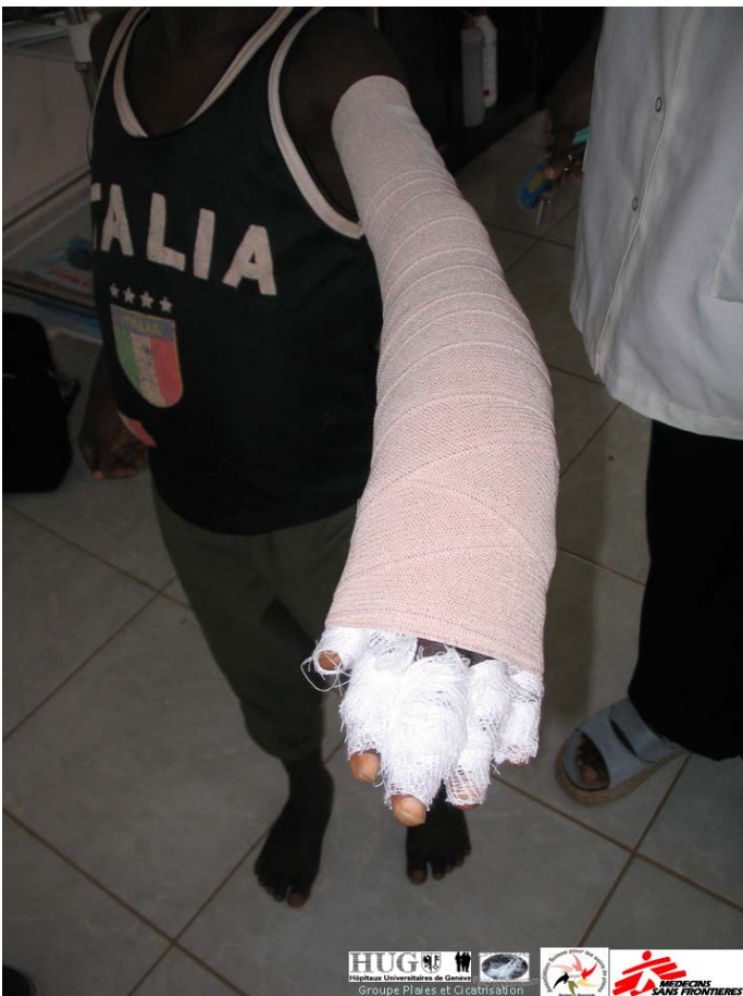
First arm compression bandage in Akonolinga