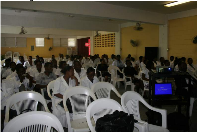
Students attending the seminar at the Universite of Notre Dame D'Haiti