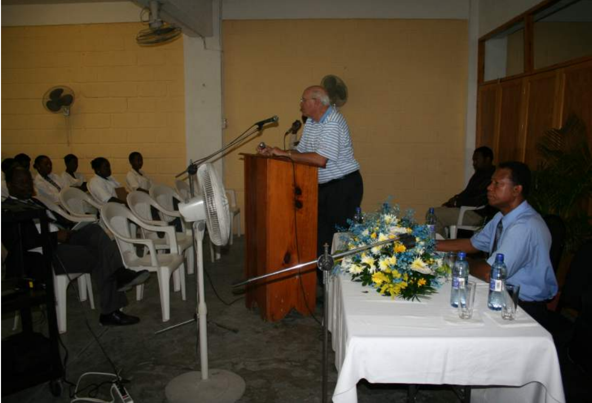
Lecturing to the medical students at the Universite of Notre Dame D'Haiti